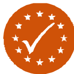
TESTED TO EN1656:2009 STANDARDS