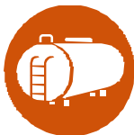
MILK BULK TANKS