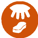
MANUAL UDDER CLEANING